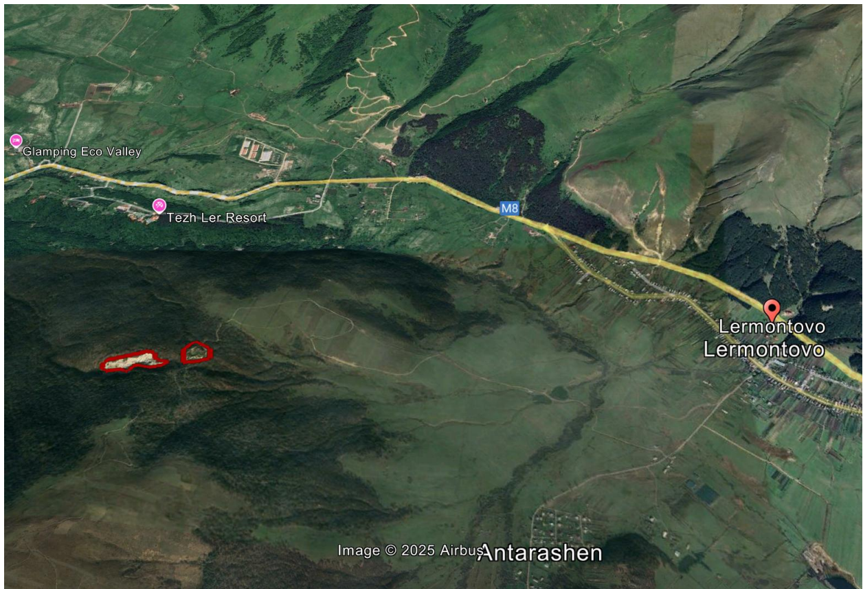
Figure 1: Location of Tandzut former mine site

A review of analytical data carried out during a previous environmental assessment will be essential to guide a risk-based remediation approach. Actions should be emphasized that focus on containing risks and hazards that could impact off-site receptors: potential examples are the transport of toxic heavy metals through surface water runoff; impacts on aquatic eco-systems and food chain through water as a pathway; and wind-blown dust from the site. The measures proposed for this site should prioritize and maximize the role of natural attenuation processes for the actual mine site, and the containment of identified, significant hazards that could reach sensitive receptors. The key environmental risks and hazards associated with the existing mine sites include: